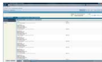
Lightning-fast search capabilities in the browser.

If you have a business application running on Windows, UNIX, System i or any other platform, integration with MultiArchive is a simple matter.