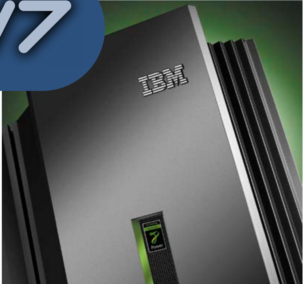
IBM and Multi-Support have teamed up to deliver a 25/7 Solution Server.