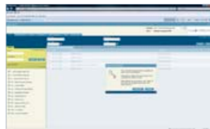
Complete check in check out functionality in the browser.

MultiArchive 7 also contains the following functionalities: